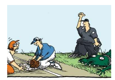
"Me? Argue? ... No, sir! That was an excellent call."